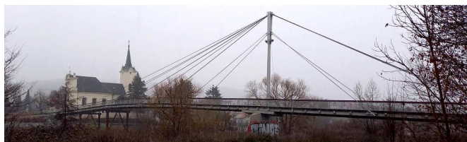
Figure 1 Original concrete footbridge

The original cable-stayed footbridge built in 1994 was a pre-stressed concrete structure with a timber deck 2,5 m wide. This structure was after 15 years of service seriously damaged and, in state of disrepair, was supported in the river by two temporary supports (Fig. 1). The new cable-stayed footbridge is positioned on the existing substructure adapted for the new structure, thus preserving the original valuable urban and contour design (Fig. 2). Additionally, the deck width was extended from 2,5m into 4 m (Fig. 14).