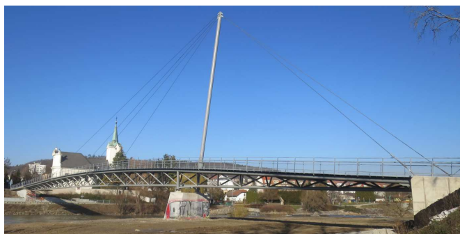
Figure 2 New triangular lattice cable-stayed footbridge